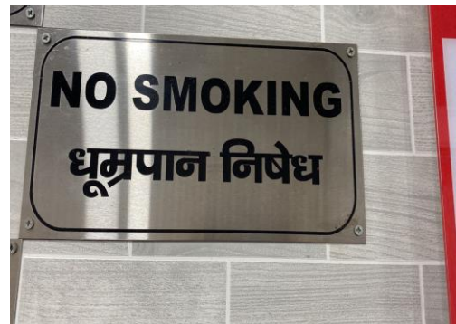
No Smoking Zone inside clinic premises