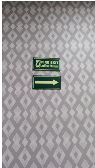
Radium Fire Exit