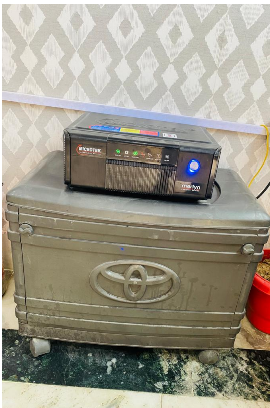
Inverter for alternate power