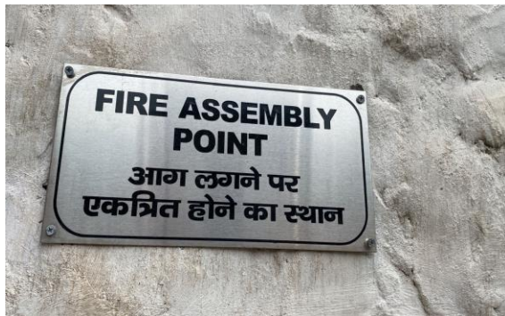
Fire Assembly Signage outside Clinic Area