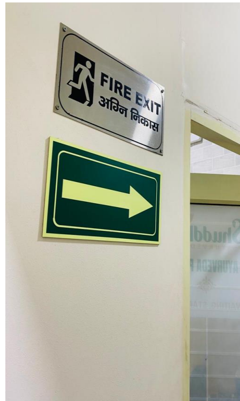
Another Fire Exit Signage